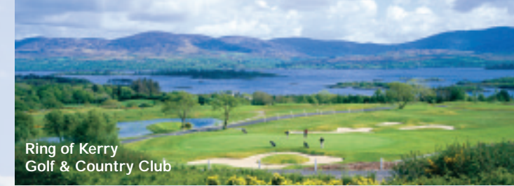
Ring of Kerry Golf & Country Club